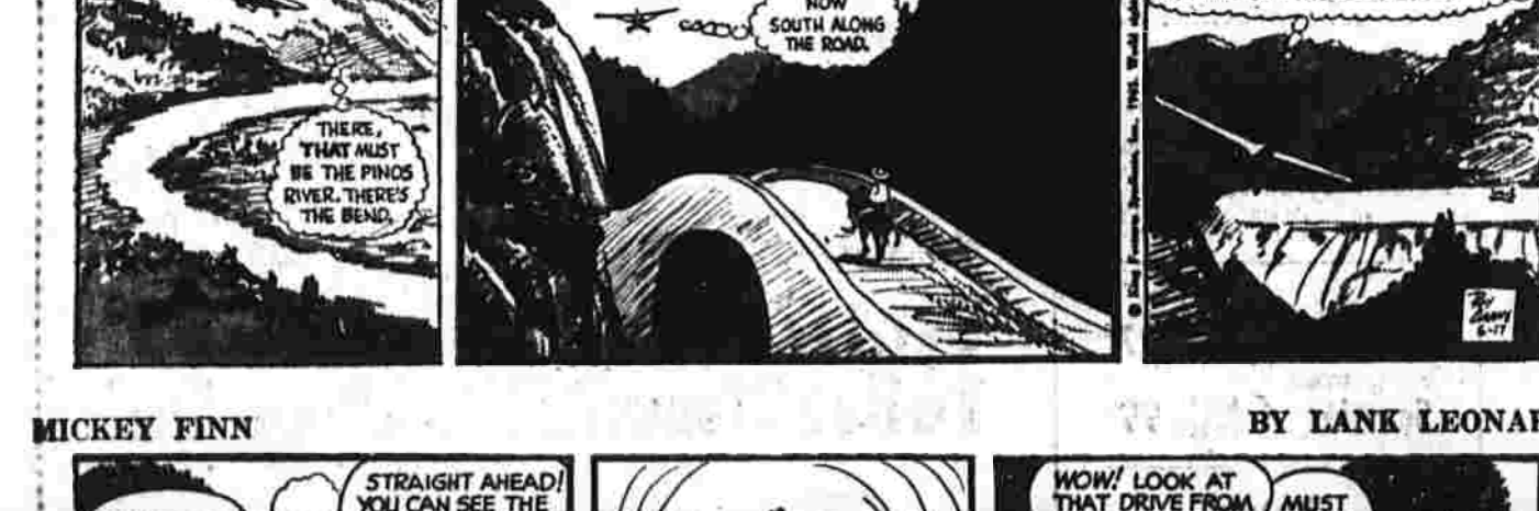
BY ROY CRANE