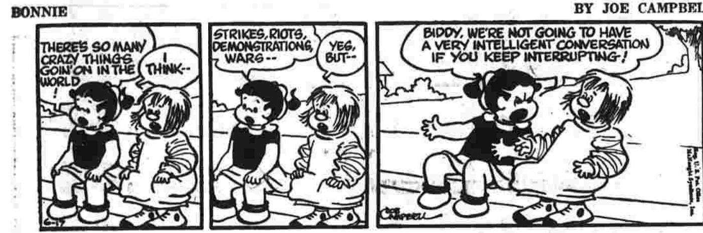
BY JOE CAMPBELL